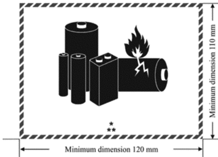
Figure 1 to paragraph (c)(3)(i)

(A) The mark must be in the form of a rectangle with hatched edging. The mark must be not less than 120 mm (4.7 inches) wide by 110 mm (4.3 inches) high and the minimum width of the hatching must be 5 mm (0.2 inches), except marks of 105 mm (4.1 inches) wide by 74 mm (2.9 inches) high may be used on a package containing lithium batteries when the package is too small for the larger mark;